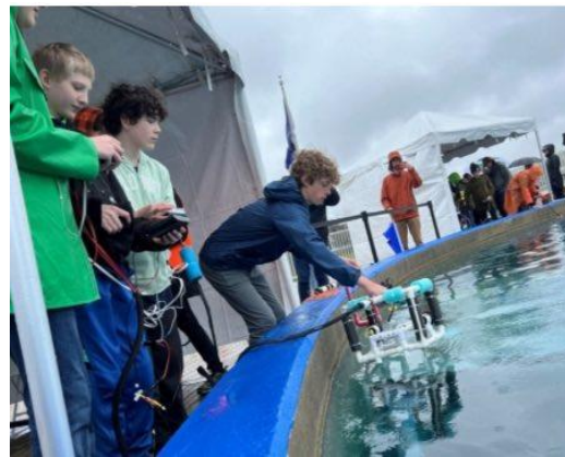
“Tarp Tech” team at 2024 MATE competition in Alpena, Michigan