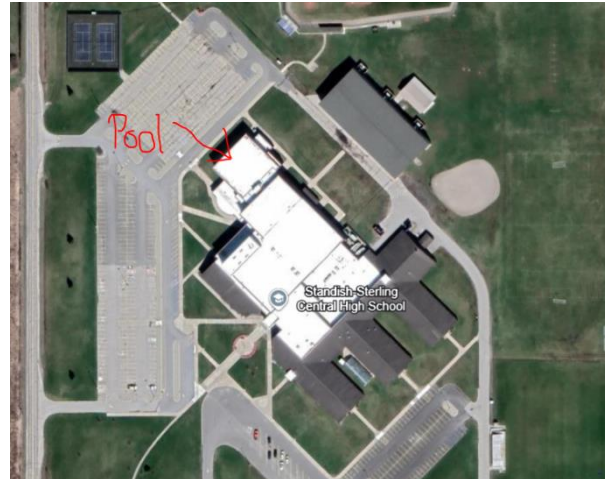
Standish Pool Location

2401 Grove Street (NE corner of Grove and Wyatt) Standish 48658