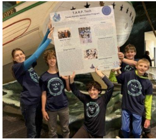
Tarp Tech team at first competition

Look for the summer edition of the NAS quarterly newsletter for a follow-up.