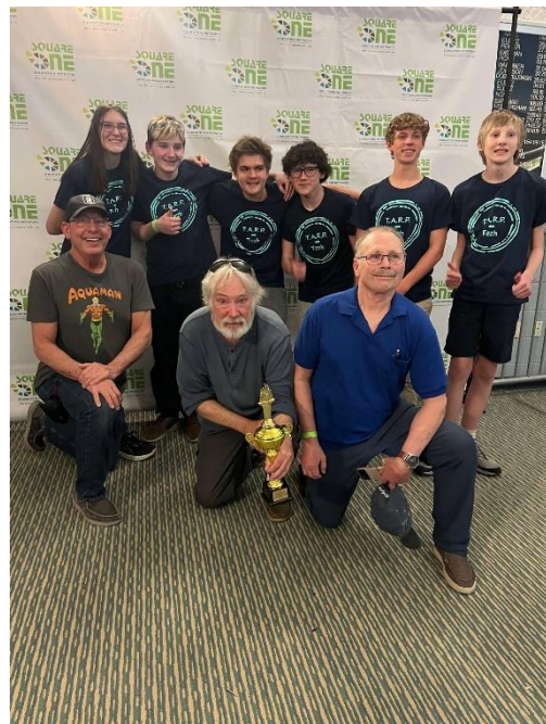
Tarp Tech with the Winning Trophies