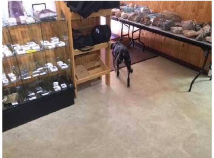
Visitor casually accepts UWA open house