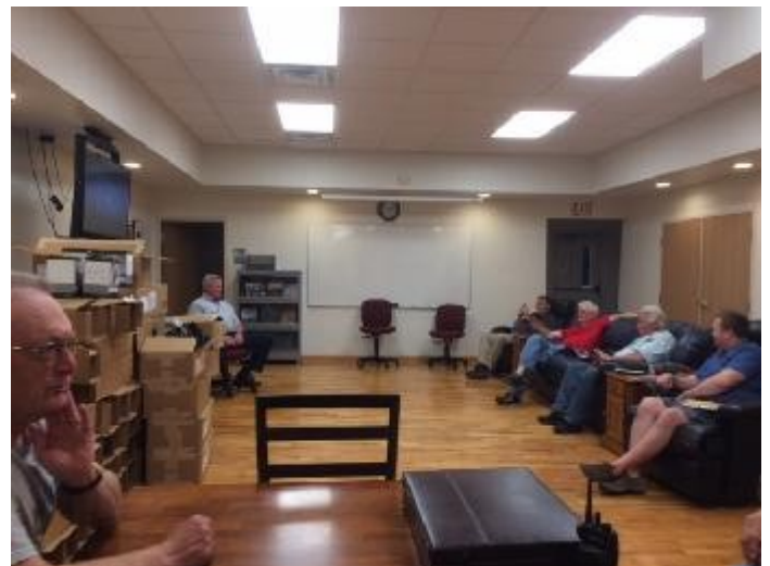
Tuesday Night Turnout